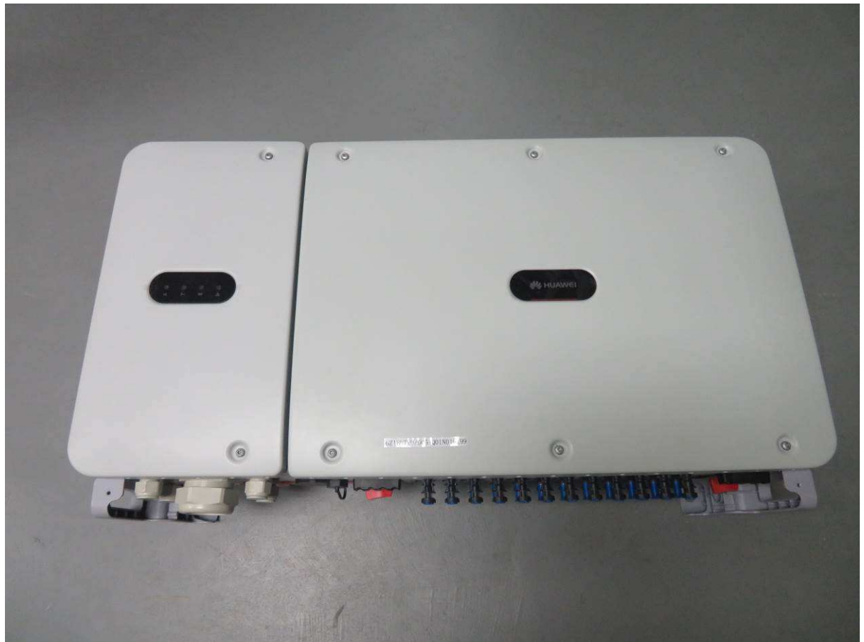
--- END ---