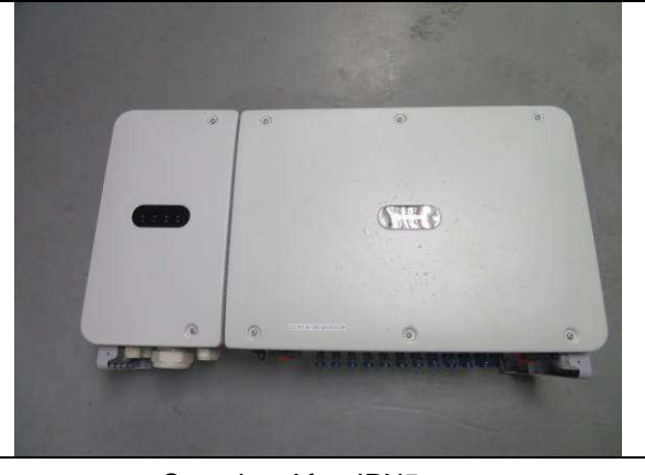
Sample-- After IPX5 test