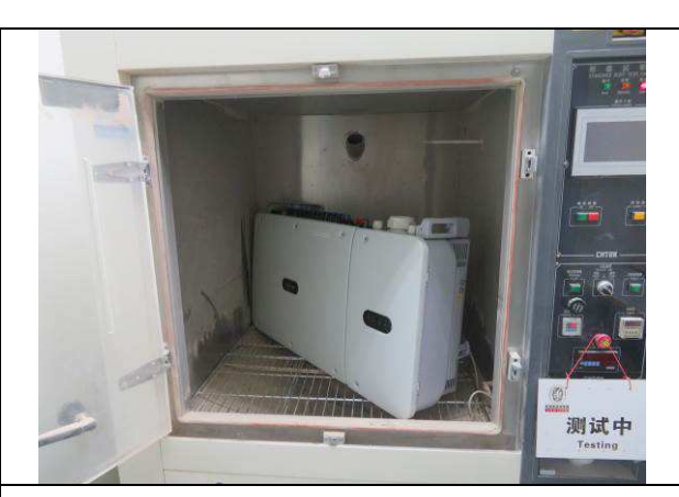
Test setup—IP6X sample in the chamber