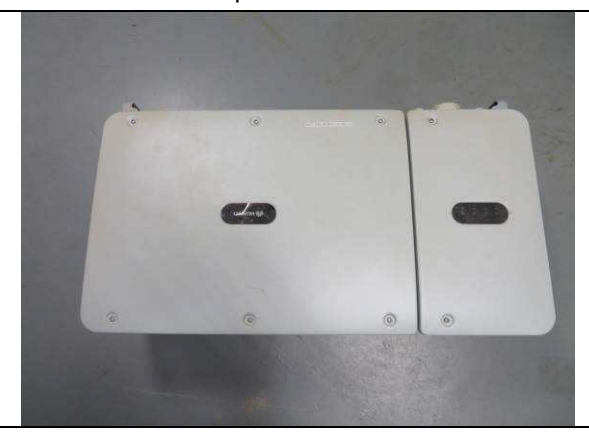
Sample-- After IP6X test